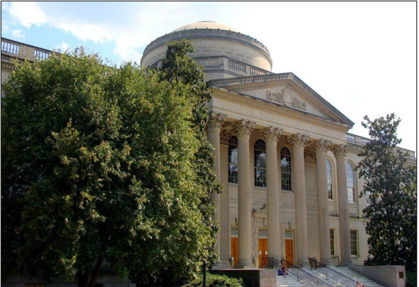
Wilson Library University of North Carolina