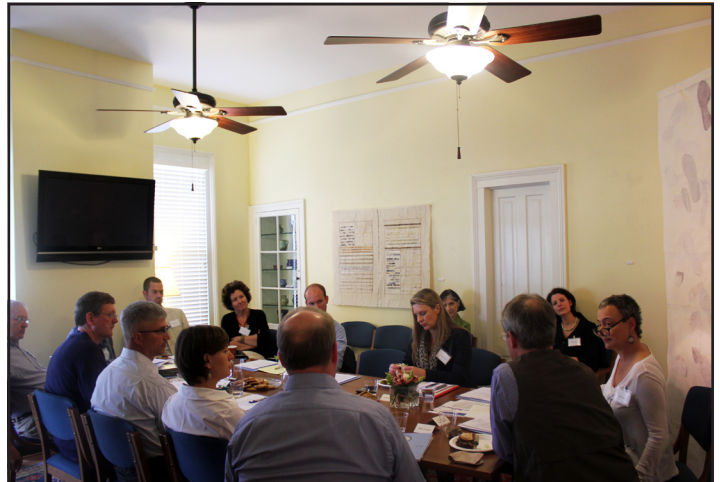
SOHP Seminar for the Right Honourable Owen Paterson, Secretary of State for Northern Ireland